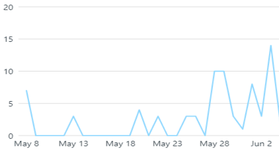
Instagram profile visits