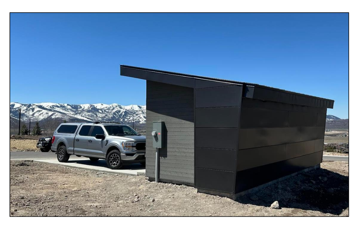
Sage Hills Control Valve Building